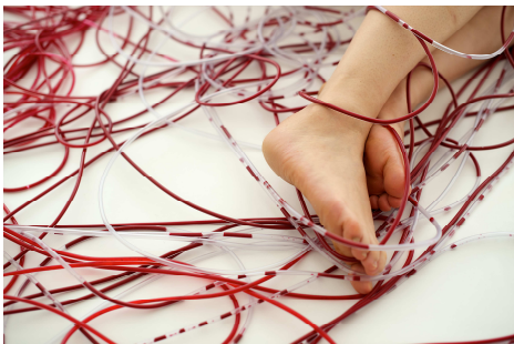
Chiharu Shiota, Wall 2010, vide, color, sound, 16:9, 3'39"

Kunsthalle Rostock, Hamburger Str. 40, 18069 Rostock